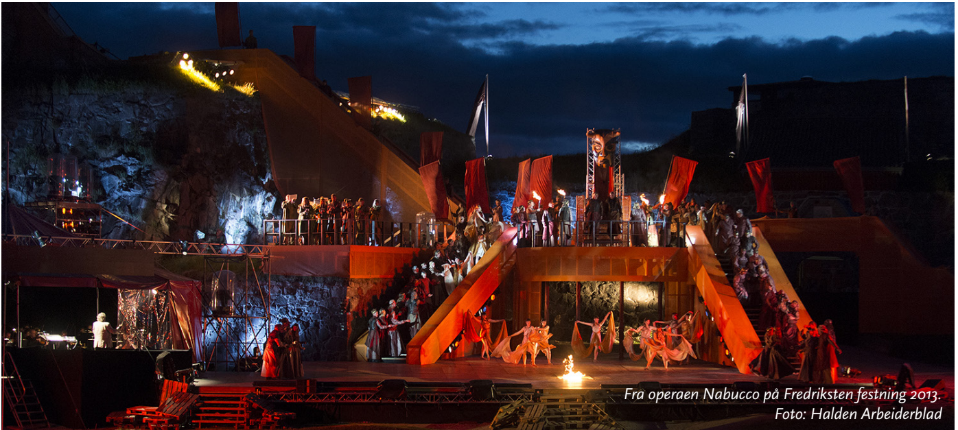
Fra operaen Nabucco på Fredriksten festning 2013.