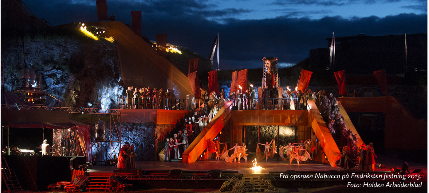
Fra operaen Nabucco på Fredriksten festning 2013.